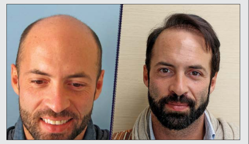
Advanced Hair Clinics' results have attracted international acclaim

Price is another major factor. Right now, hair restoration in the UK can cost up to £30,000, whereas the maximum in Greece would be about £4,000. "As a side effect of the Greek financial crisis, we can offer high-quality services from well-trained, multilingual staff at very competitive prices. There are cheaper countries, but not with our medical skills and standards," he expands.