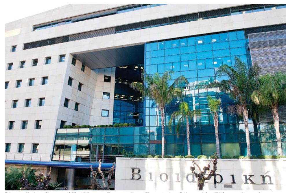
Biomedicine Group of Healthcare Companies offers state-of-the-art facilities and services

through CrossBorderMedCare, which is Temos international healthcare accredited and certified by the Diplomatic Council as one of the world's best healthcare companies. For emergency treatment, "We cooperate