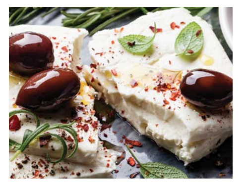
Cultivating exports Whether its food, drink or medicine, agribusiness companies are shining examples of successful Greek exporters