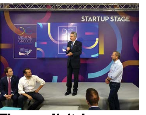
The new digital economy Greece is scaling up its telecoms infrastructure, while investing in technology and its innovative startups